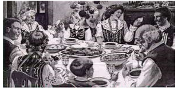
Sharing Oplatek at the traditional Christmas Eve Dinner, "Wigilia."

Bringing 24 Hour Catholic Radio to the Tri State Area